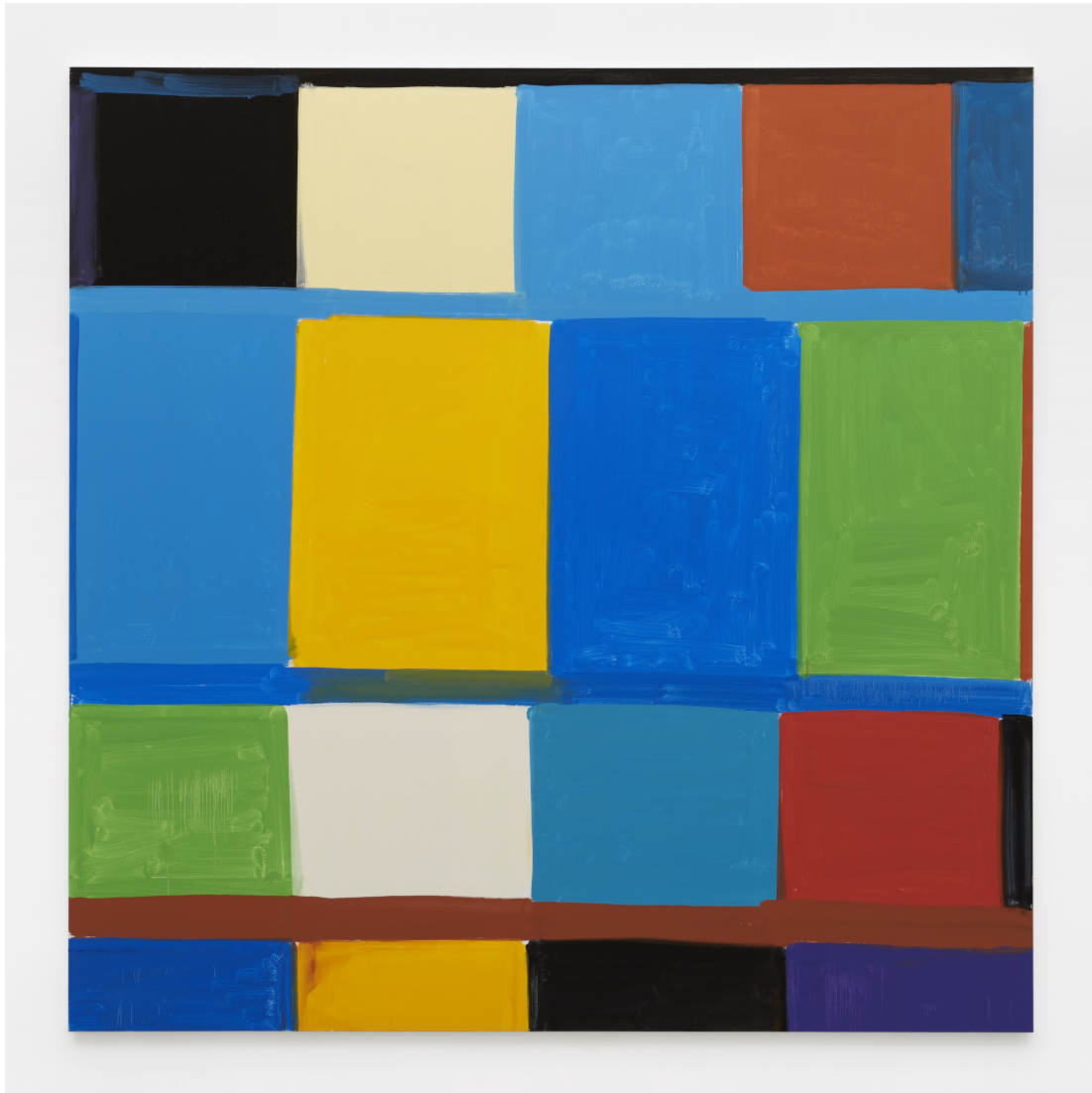
Stanley Whitney, How Black is That Blue, 2020, Oil on linen.

topographical lines in the foreground underscore their gentle smoothness. These drawings are the silk lining to the velvet outer layer of the Cage paintings.